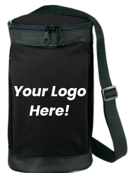
Golf Bag 6-Can Cooler Qty: 150 $10.23/$1,534.50