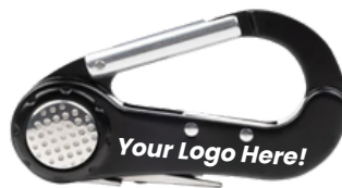
Golf Tool with Carabiner Qty: 150 $9.74/$1,460.80