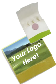
Golf Tee Match Book Qty: 150 $1.83/$274.45