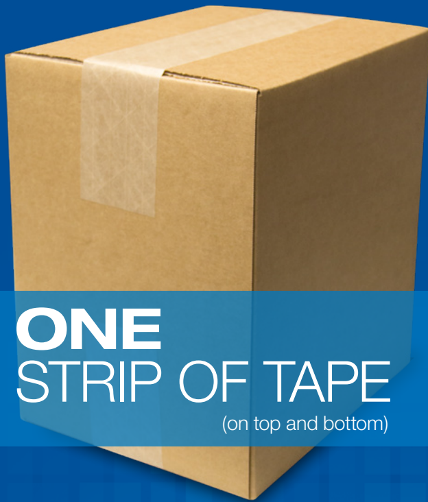
ONE STRIP OF TAPE (on top and bottom)