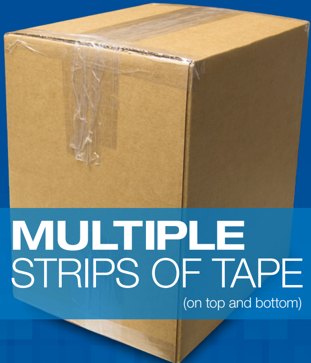
MULTIPLE STRIPS OF TAPE (on top and bottom)